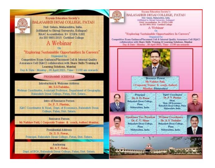
Convenor Competitive Examination Guidance Cell